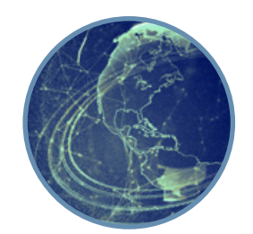
Join a Worldwide Network