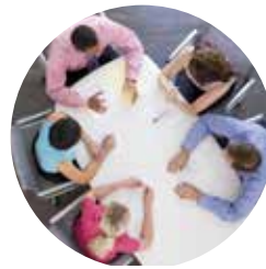
SMI Business Meeting