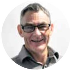
SMI Board of Councilors

A Quarterly Publication of the Society for Mucosal Immunology